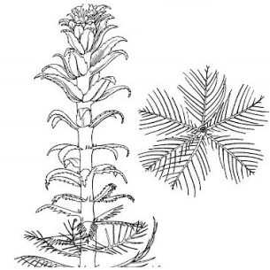
Invasive Variable Leaf Milfoil